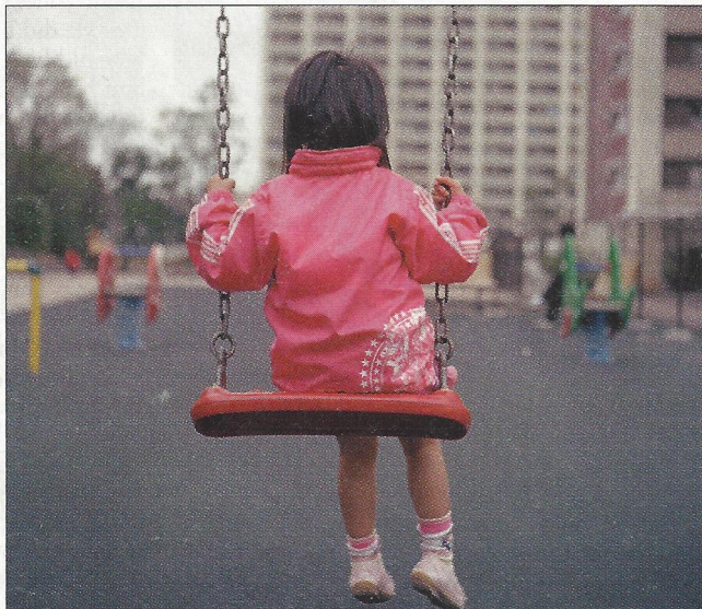
How smart is she? Labeling her 'working class' will affect your answer.

L ONG AGO, HUMANS began labeling and cataloguing each other. Eventually, lighter-skinned humans became "whites," darker-skinned humans became "blacks," and people with intermediate skin tones became "yellow-," "red-," and "brown-skinned." These labels don't reflect reality faithfully, and if you lined up 1,000 randomly selected people from across the earth, none of them would share exactly the same skin tone. Of course, the continuity of skin tone hasn't stopped humans from assigning each other to discrete categories like "black" and "white"—categories that have no basis in biology but nonetheless go on to determine the social, political, and economic well-being of their members.